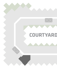
WEST MOUNTAIN KEYPLAN

Custom B&B Furniture Package included with the purchase of studio and one bedroom homes in the West Mountain