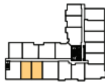
Floor 6 100 sq.ft. Terrace