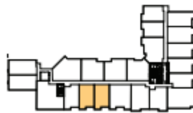
Floors 7, 8