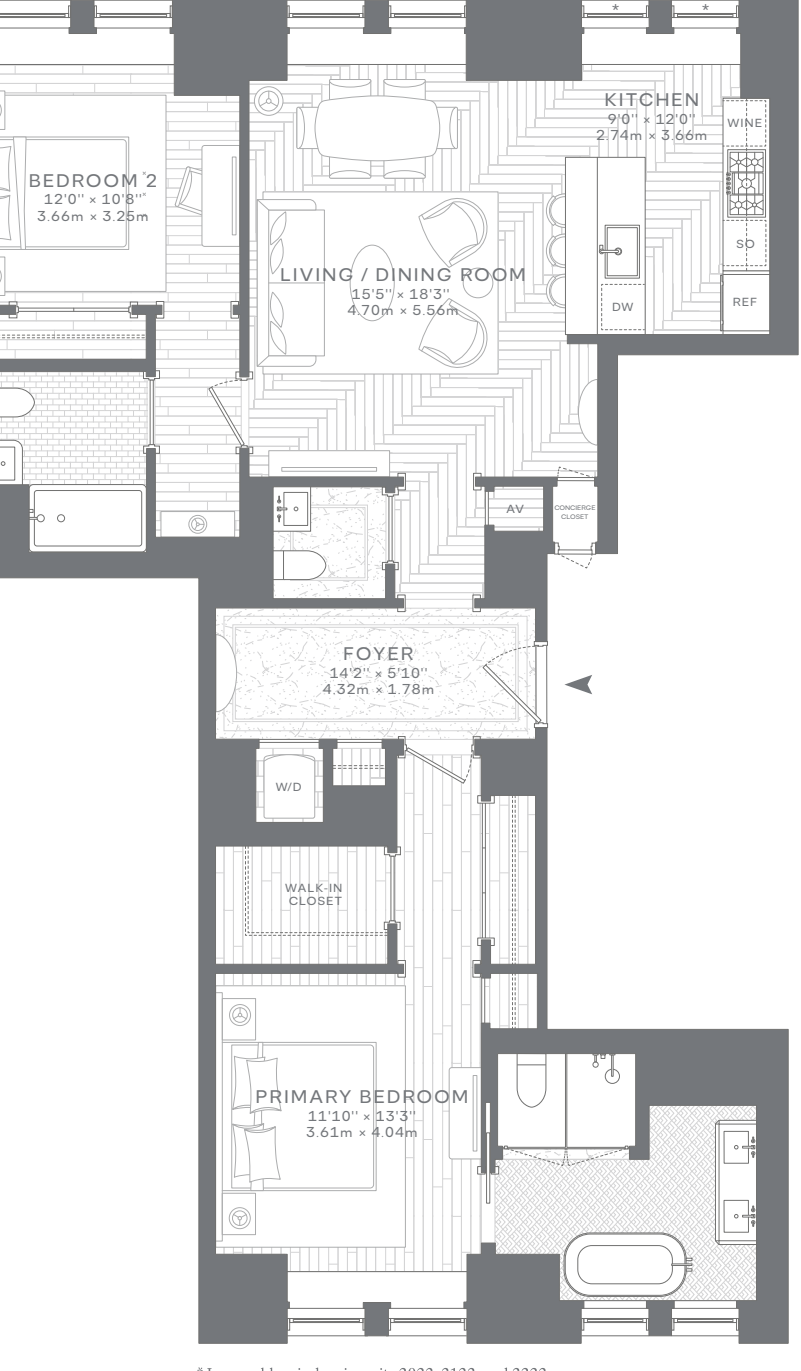
* Inoperable window in units 2022, 2122, and 2222